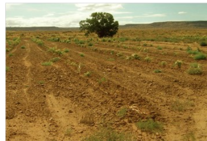
Prolonged drought conditions can cause severe damage to croplands.